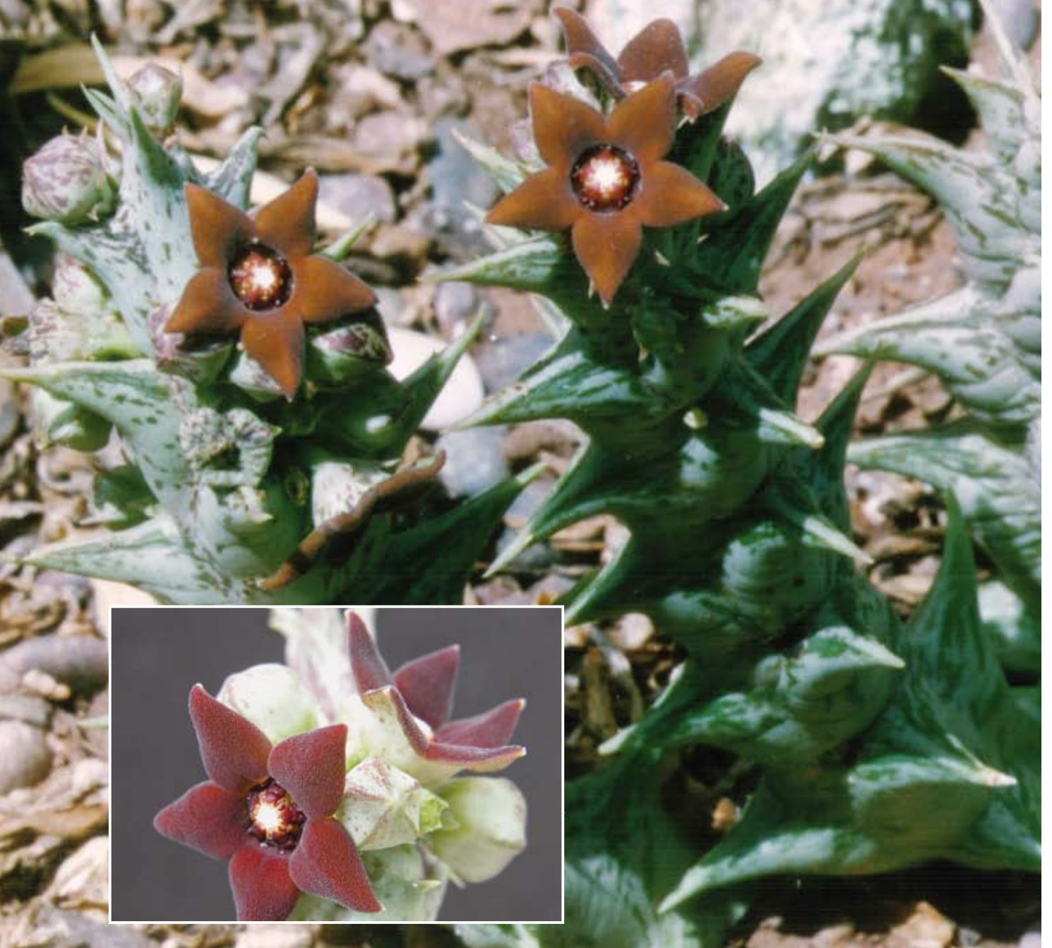
Fig. 3 above: Orbea decaisneana Mirleft, S. of Agadir. Fig. 4 inset above: Orbea decaisneana JAA 211 Gorges Massa, Oumahrrouz. Fig. 5 right: Caralluma burchardii in cultivation.

in 1929, but this was a relic population. This plant often grows with Argania spinosa (Sapotaceae), Senecio anteuphorbium , Warionia saharae (Asteraceae) and Acacia gumifera (Mimosaceae). It enjoys the humidity near the coast where it is locally abundant. O. decaisneana is not difficult to find as it often grows out in the open (figs. 1 and 2 previous page). As it is poisonous, it does not suffer from overgrazing. This species is the most common in our collections, as it is easy to grow.