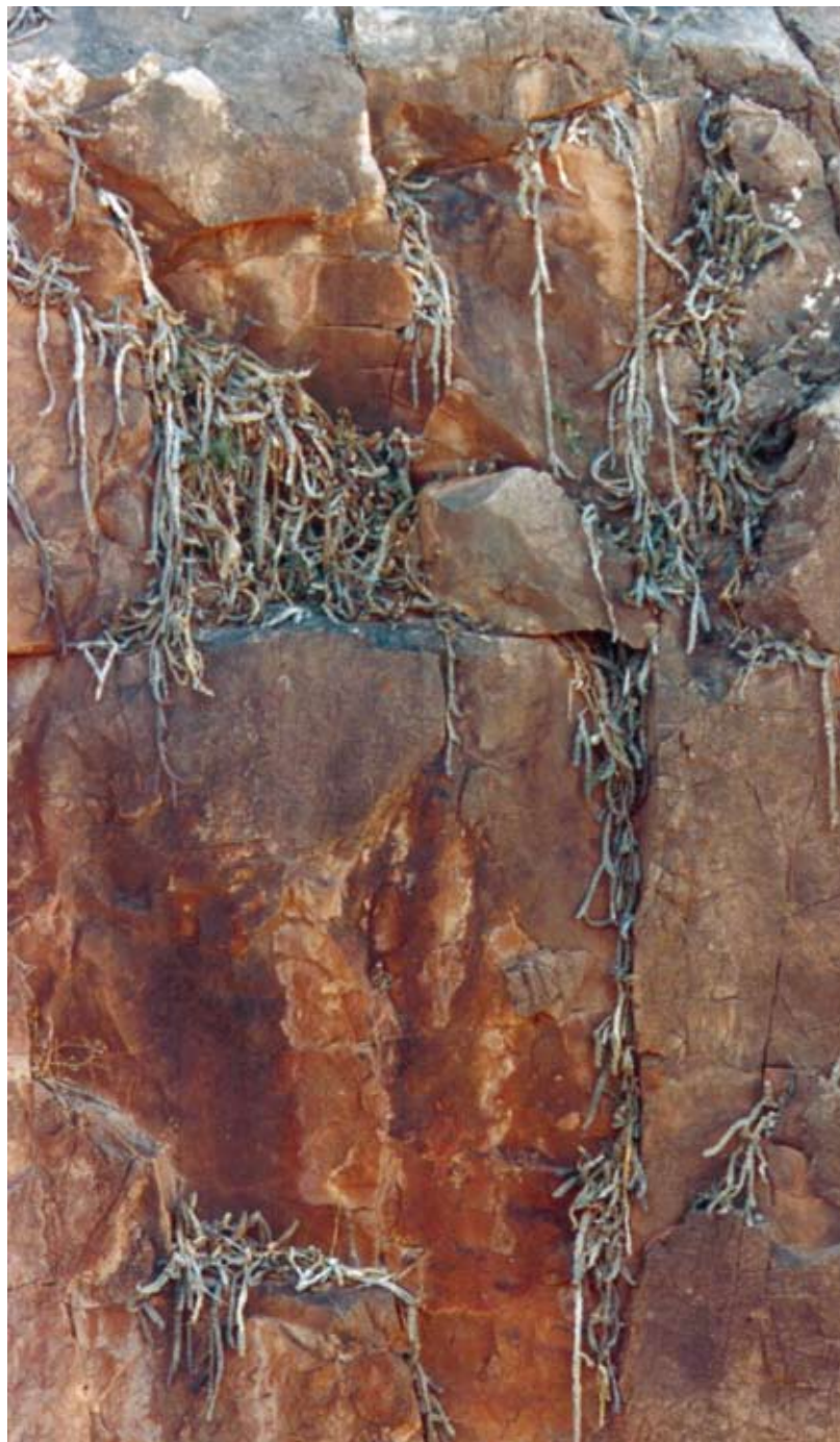
Fig. 14 above left, Caralluma joannis Aoulouz, S. of Haut-Atlas; Fig. 15 right: Same species S. of Haut-Atlas. Figs. 16 & 17 below left, same species in flower Aoulouz S. of Haut-Atlas; right: Same species JAA 207 in cultivation.