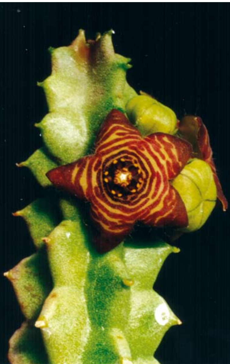
Fig. 10 left: Caralluma europaea JAA 197 W. Tafraout Anti-Atlas in cultivation. Fig. 11 on p. 26 shows the habitat. Fig. 12 below left: same sp. Rif N. of Morocco. Fig. 13 right: Caralluma joannis Aoulouz, S. of Haut-Atlas.

It has no particular cultural requirements.