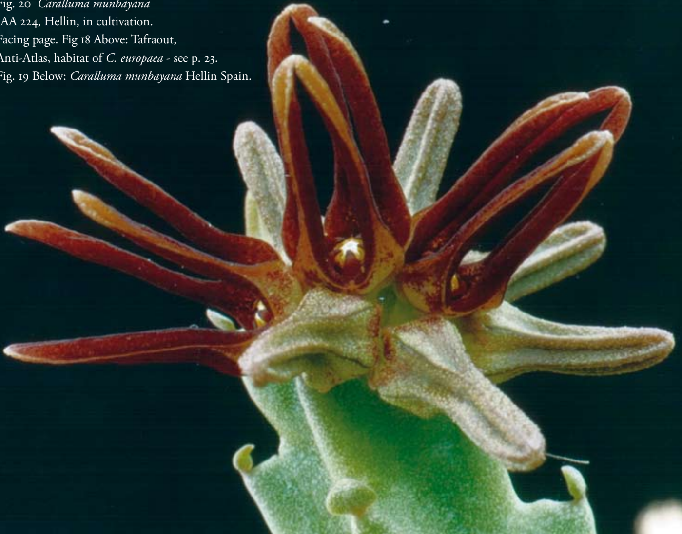
Fig. 19 Below: Caralluma munbayana Hellin Spain.

geria. In Morocco, it grows in the extreme north-east of the country, in the region of Oujda. Not having been able to get to this locality, in the winter of 2000/2001, I looked for it in Spain, and found it in the province of Murcia. It is a difficult plant to find as it is hidden in clumps of Stipa sp. (fig. 19 left). At this time of the year temperatures were fairly low and the soil was being soaked by frequent showers. One would therefore assume that a plant growing in such conditions would be tolerant in cultivation. In fact I have found it the least easy of all those mentioned in this article.