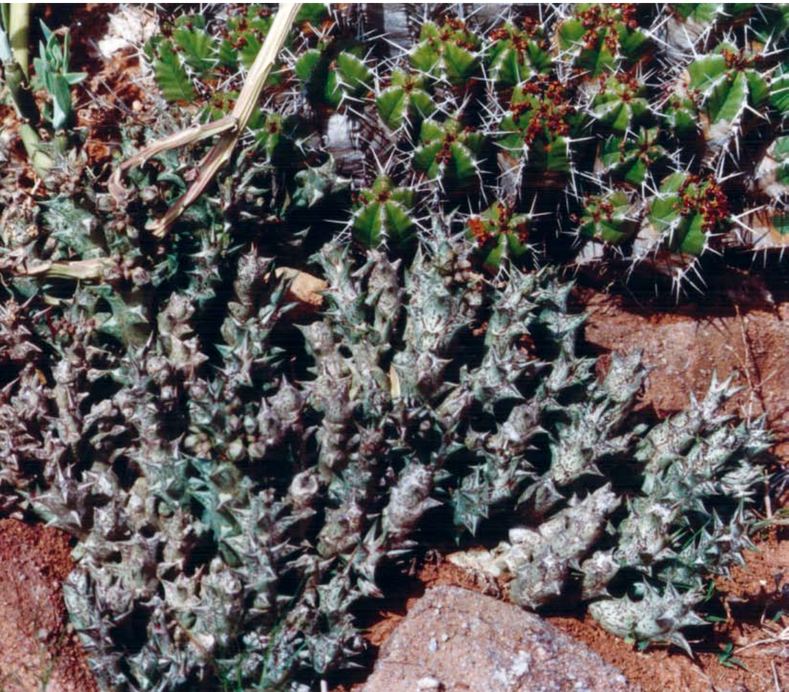
Fig. 2 right: same species with Euphorbia echinus Oued Ouarksiz, S. of Sidi Ifni.

Fig. 1 below: Orbea decaisneana Mirleft S. of Agadir.