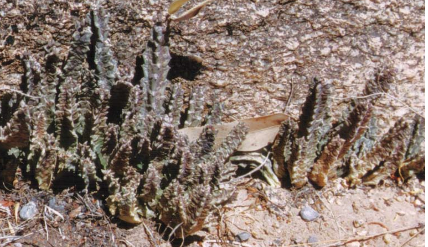
Fig. 8 above: Caralluma europaea W. of Taфраout Anti-Atlas. Fig. 9 right: Caralluma europaea Bert Jonkers 217 Aoulouz S. of Haut-Atlas.

the rainy season. Only those emerging in the middle of a clump of vegetation armed with spines have any chance of survival. The cultivation of this plant does not seem to pose any particular problems.