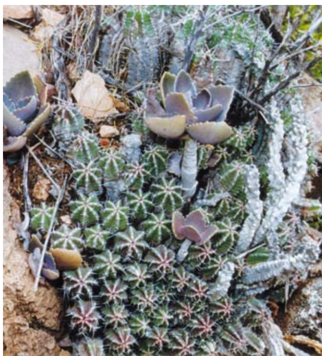
Fig. 6 above: Caralluma burchardii ssp. maura & Euphorbia echinus Mirleft, S. of Agadir. Fig. 7 left: Same species with Kalanchoe laciniata ssp. faustii Oued Ouarksiz S. Sidi Ifni Maroc.

on pedicels and smaller (fig. 5). This species can be found on the Atlantic coast from north of Agadir to Oued Noun. The associated vegetation is composed principally of Euphorbia echinus (south of Agadir), E. officinarum (north of Agadir), E. lamarckii , Argania spinosa , and Kleinia anteuphorbium . Unlike Orbea decaisneana , which is poisonous, C. burchardii ssp. maura is not only appreciated by the goats and sheep, but equally by the Berber tribes, who eat the young shoots. It is a more difficult plant to find in habitat. You have to look in spiny bushes or in tufts of Euphorbia echinus (figs. 6 & 7). Seeds falling into these formidably spiny clumps can thus germinate sheltered from predators. C. burchardii ssp. maura also has the ability to send out underground runners that emerge from the ground in